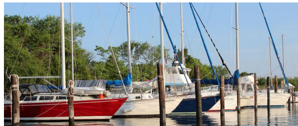
Dandy Haven Marina

The Marina has supported environmentally friendly initiatives including the Chesapeake Bay Foundation since 1984, and the Hampton watershed restoration, in all its efforts, for many years. The Marina hosts two shoreline clean-ups each year (weather permitting) and oyster-in-cage from seed-to-reef for volunteers that don't otherwise have access to suitable waterways. Subaquatic grass transplantation/restoration (in association with The National Aquarium in Baltimore), sea horse habitat surveys, underwater bomb detection validations, and donation of concrete drainage pipe to Virginia's Back River reef program are among a few of the efforts the Marina has supported. Since