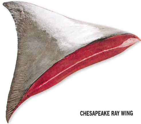
CHESAPEAKE RAY WING