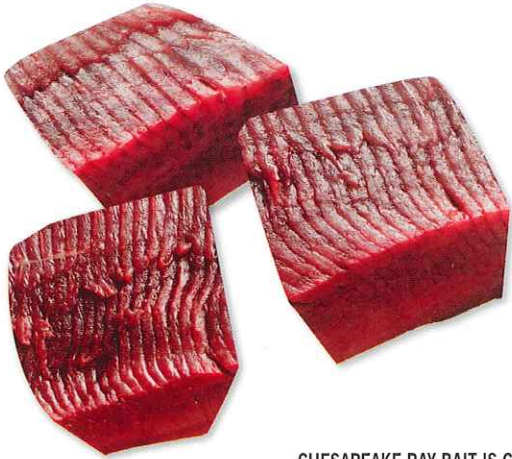
CHESAPEAKE RAY BAIT IS CUSTOM CUT TO THE SIZE NEEDED.