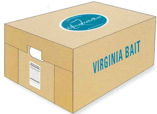
CHESAPEAKE RAY BAIT SHIPPING CARTON