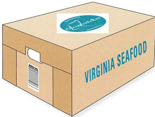
CHESAPEAKE RAY SHIPPING CARTON