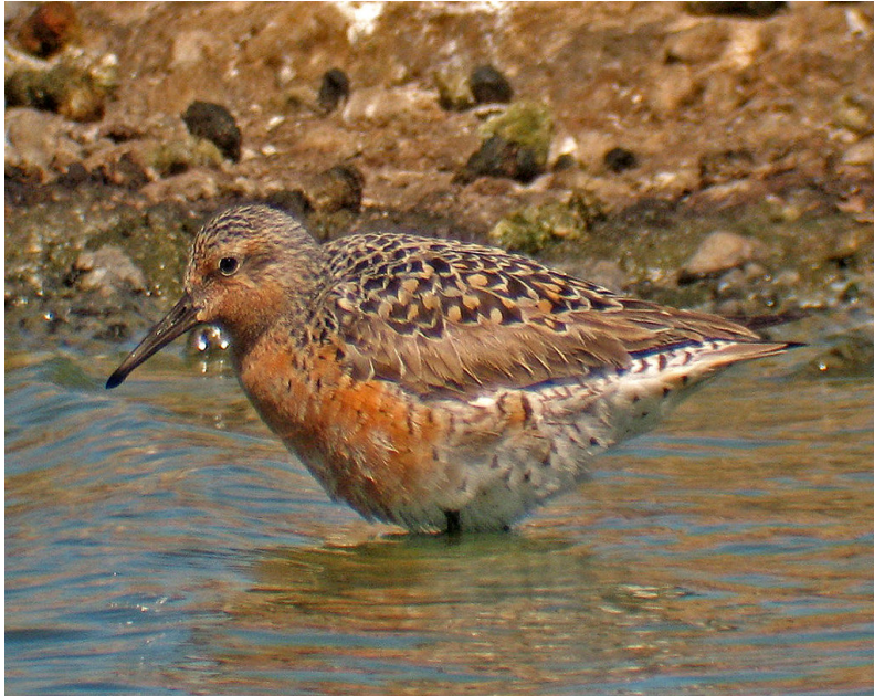
"Red Knot" by K Schneider is licensed under CC BY-NC 2.0