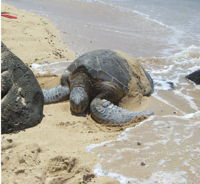
"Sea Turtle" by AntoinetteDubey is licensed under CC BY 2.0.