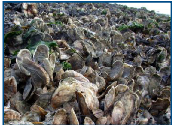
Healthy oyster reefs with large, long-lived oysters can help buffer the acidity of estuarine waters in Chesapeake Bay and other coastal ecosystems worldwide.

“Oyster shells are like slow-dissolving TUMS in the belly of Chesapeake Bay,” explains Mann. “As ocean water becomes more acidic, oyster shells begin to dissolve into the water, slowly releasing their calcium carbonate—an alkaline salt that buffers against acidity. An oyster reef is a reservoir of alkalinity waiting to happen.”