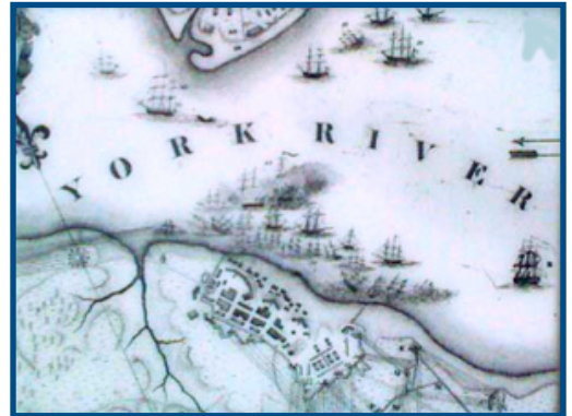
A historical map showing some of the vessels scuttled in the York River during the siege and Battle of Yorktown in 1781.