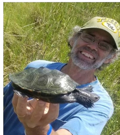
(left) Two terrapins basking at high tide on the rock sill of a Living Shoreline marsh. (right) Female terrapin captured at low tide in a fyke net in front of a Living Shoreline marsh.