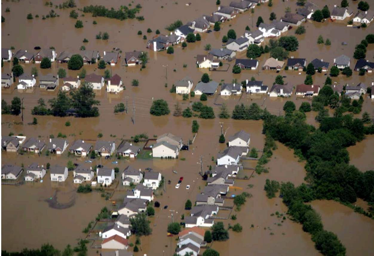
Since a catastrophic flood struck the Pennington Bend neighborhood in Nashville, Tennessee, on May 3, 2010, the local government has purchased and removed hundreds of homes from this and other flood-affected areas.

occur. 66 FEMA could partner with NOAA and other agencies to expand resources and capacity for “train the trainer” sessions, with the goal of developing local leaders. Virtual options could also increase community participation. In particular, FEMA could support state- and locally led “visioning sessions” in which communities describe their priorities for buyouts, including ideas for relocation and creation of open spaces offering recreational co-benefits. 67