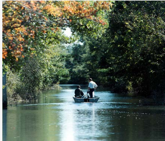
People travel by boat along Davis Street in Kinston, North Carolina, on Sept. 30, 1999, after Hurricane Floyd caused the Neuse River to flood the area. The city bought several of the homes closest to the river as part of a local buyout program.

In addition to these relocation funds, Kinston and Lenoir County residents were able to take advantage of both FEMA HMGP and HUD CDBG resources leading to the buyouts of over 1,600 homes from 1997 to the early 2000s. 62 This high participation rate is partially attributable to the combination of federal and state dollars, a recommendation that Pew makes in this report; however, understanding the social vulnerability of the community and offering relief were key to individual decisions to move out of harm's way. Still, Kinston is not universally regarded as an example of success. Some officials have criticized the "breaking apart" of a historically Black community, and residents living in proximity of the buyout area have complained that the acquired property has not been properly maintained. 63