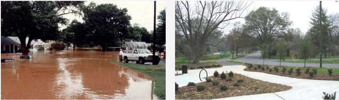
Westfield Road in Charlotte, North Carolina, during a flood on Aug. 4, 2011, left, and after Mecklenburg County's Floodplain Buyout Program bought and removed homes on the street and converted the land into greenspace, right, which helps absorb excess water and provides environmental and recreational co-benefits.

A FEMA- or HUD-funded property purchase is generally not the straightforward exchange between buyer and seller that people would recognize from a standard real estate transaction.