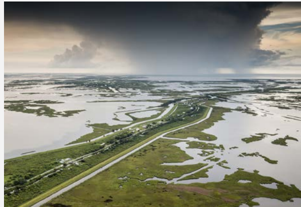
Storm clouds gather above Isle de Jean Charles in Terrebonne Parish, Louisiana. After repeated severe floods, Louisiana initiated a relocation program in 2017 to move island residents to a safer inland location.

About an 80-mile drive southwest of New Orleans, along the furthest reaches of Louisiana’s coastline, sits Isle de Jean Charles, an island community that once encompassed more than 22,000 acres but has been reduced to just 320 acres by sea level rise and significant flood events. 54 The island had been home to as many as 80 households, but only about half that total remained in 2016, when HUD’s National Disaster Resilience Competition awarded the state $48.3 million to relocate the entire community, as a group, to a new upland home. 55