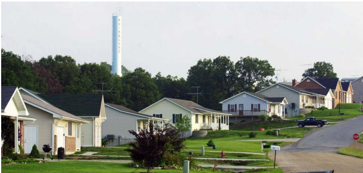
Newly constructed homes in Rhineland, Missouri, sit on a hill above the town's former location. Rhineland residents opted to relocate as a community after a major Missouri River flood disaster in 1993.

Then in 1993, the role of buyouts shifted significantly toward supporting nonstructural flood-risk management, such as elevations, floodproofing, and removal of structures, including voluntary relocations. 10 That year, floodwaters covered huge swaths across nine Midwestern states, and the scale and duration of the disaster overwhelmed residents and local and state officials. Many families and communities that had persevered and rebuilt after previous flooding began to consider moving out of harm's way. 11