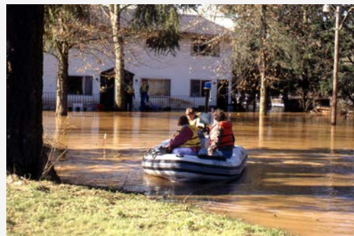
Flood survivors use an inflatable raft to navigate a residential neighborhood in the Portland area during the 1996 Willamette flood in Oregon. The disaster affected much of the Portland metropolitan area and prompted the city to launch an ambitious watershed management project that included property buyouts.

Beginning in 1997, Portland began planning an ambitious watershed project to provide a common solution for nuisance flooding, water quality problems, and fish and wildlife declines. Over the ensuing 15 years, the project acquired more than 106 acres, removed over 70 structures, and implemented nature-based strategies, 38 all financed using a combination of three state and federal sources: pre-disaster funds from the city's Bureau of Environmental Services and HMGP and CDBG-DR grants. The varied funding sources enabled the program to create a robust approach that addressed multiple issues.