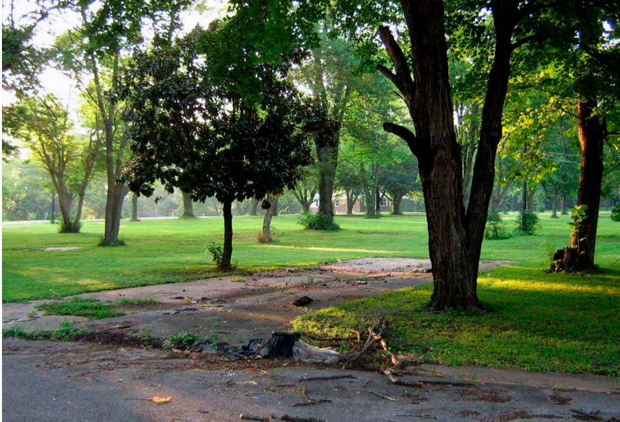
A 10-acre lot along Mohawk Trail in Hopkinsville, Kentucky's Cherokee Park community stands nearly vacant. Most of the 50 homes that were previously on the parcel were removed as part of a flood buyout program.

Finally, all buyout plans should address the potential consequences of relocation for high-risk communities, particularly the disruption of essential social networks and access to vital services. People of color, renters, those with mobility challenges, and older adults may have compelling reasons to fear moving—including the need to be close to work, family, and community support networks—even when they reside in high-risk areas. Alternatively, they simply may not have the means to relocate or know where to go. Federal guidelines should make clear that preserving community and livelihoods should be an essential element in planning buyout programs in these higher-risk communities.