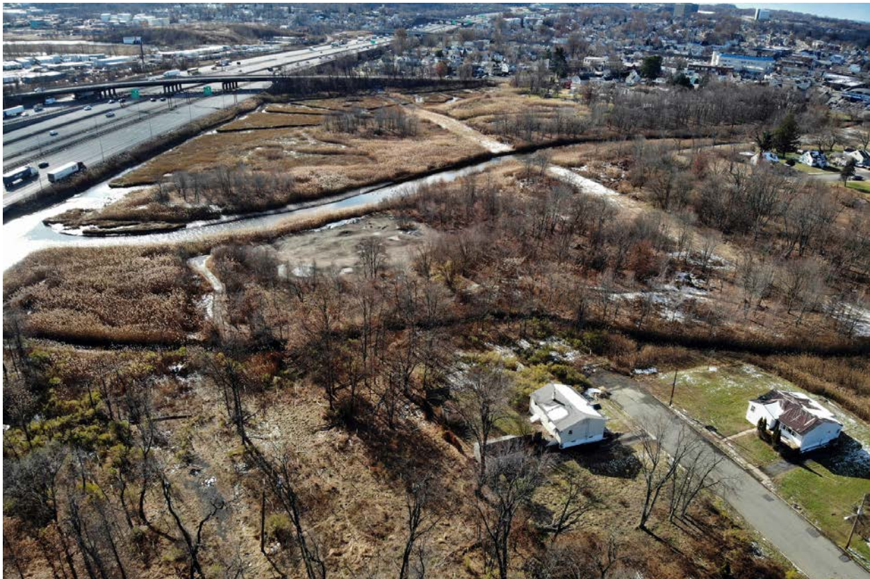
This forest in a flood plain in Woodbridge, New Jersey, grows in what used to be the Watson Crampton neighborhood. Homeowners in the community accepted buyout offers through the state's Blue Acres program.

In addition to identifying these challenges, the workshop sessions and research also yielded recommendations aimed at improving the use of buyouts as a flood-preparedness tool. Although local governments typically have direct authority over land use, including management of flood-prone lands, the recommendations focus on federal policies because a large share of buyouts are wholly or largely funded with federal resources and because the rules and regulations governing federal funds influence state and local efforts to create and sustain buyout initiatives. To ensure that the recommendations are achievable, Pew focused on policies that departments and agencies, particularly FEMA, can implement relatively quickly and without statutory changes. Although some