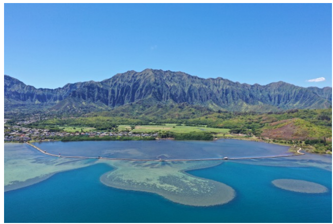
Fig. 3. An aerial view of He'eia Fishpond, the largest Indigenous aquaculture system in He'eia, which covers approximately 36 hectares (88 acres) of the estuary and is stewarded by Paepae o He'eia (a comanagement partner in the He'eia NERR). It is estimated to be approximately 800 years old, and, after falling into disrepair and being inundated with invasive mangroves for several decades, has been the focus of biocultural restoration efforts since 2001.

As a result of this study, government agencies have a better understanding of the connection between removal of invasive mangrove and improvements to water quality. This restoration project is now held up as a model for sustainable development in policy circles, especially those around the state-sanctioned Hawai'i Green Growth initiative and the Sustainable Hawai'i goals.