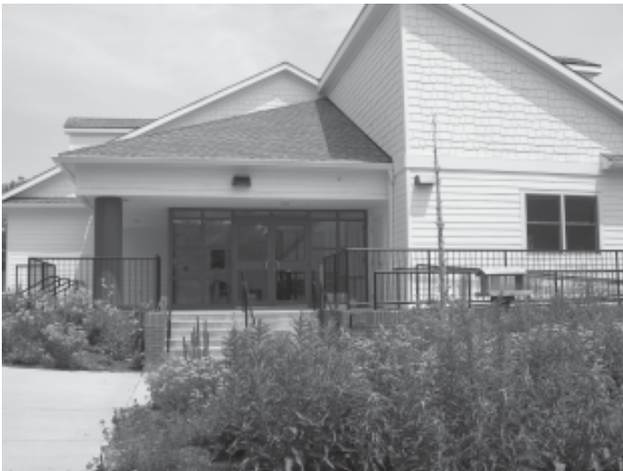
Chesapeake Bay National Estuarine Research Reserve in Virginia Catlett-Burruss Lab