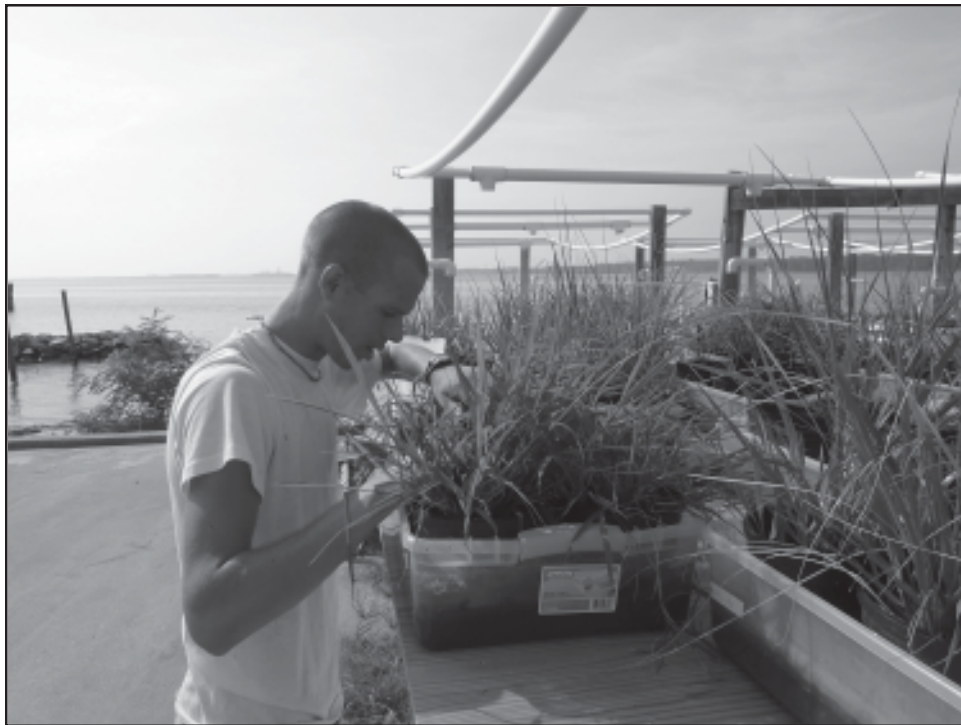
SAV Sea Level Rise Studies

The Department of Biological Sciences maintains close contacts and shares instrumentation with the other departments at VIMS. Also available are computer facilities with support of both Windows and Macintosh platforms ranging from in-lab laptop units, to work stations supporting LANs, to an institute-wide network.