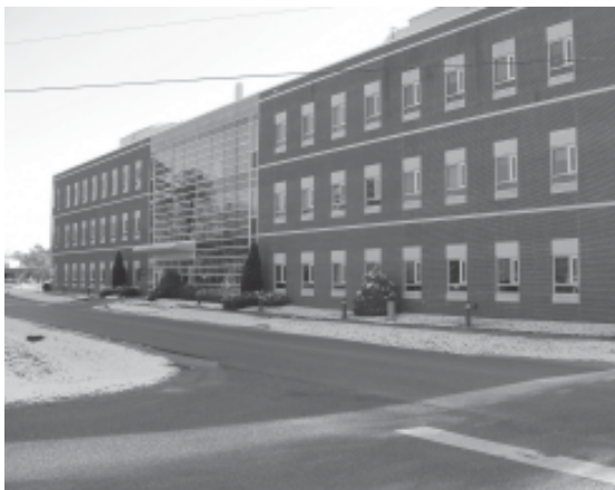
Chesapeake Bay Hall