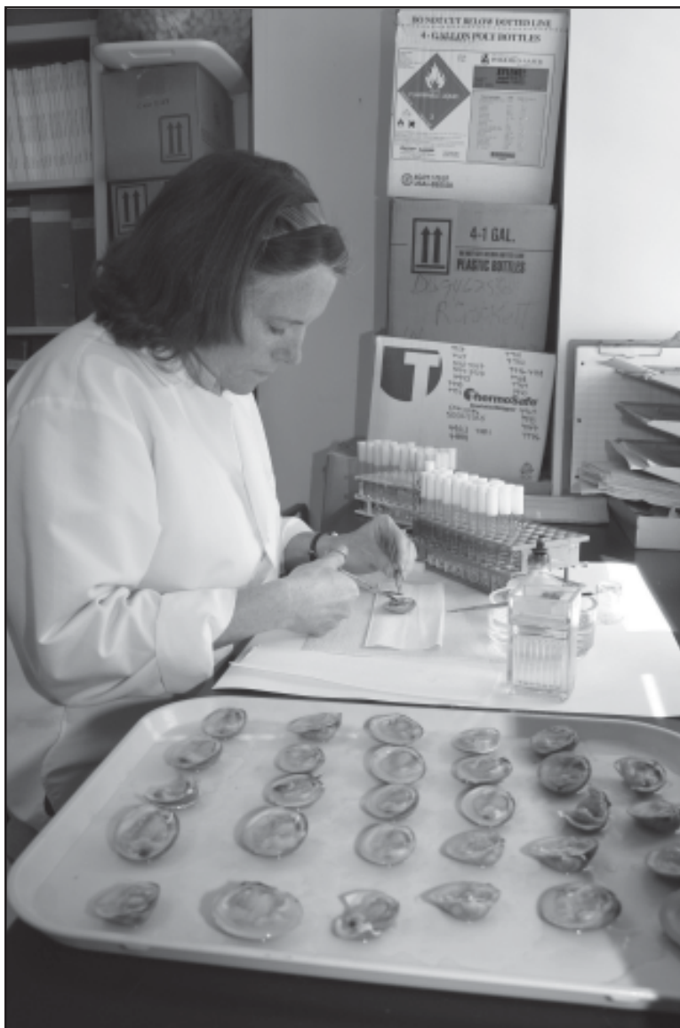
Testing for Perkinsus

The present facilities and equipment available in the department are described in more detail on the departmental website.