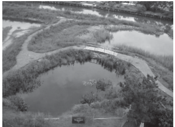
VIMS Teaching Marsh